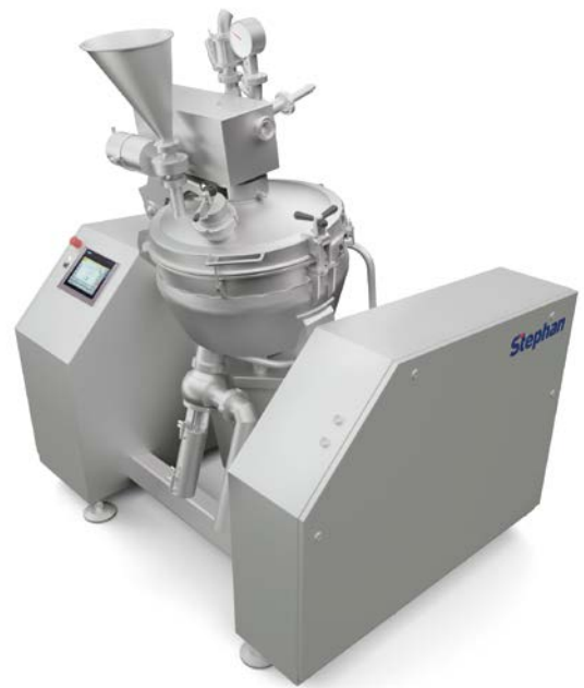
STEPHAN Universal Machine UM 70

The machines shown are for illustrative purposes only. Actual machine construction may vary by specification.