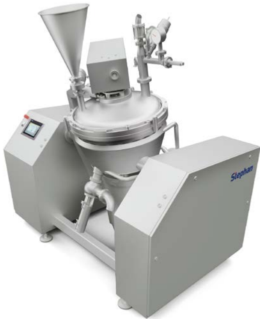
STEPHAN Universal Machine UM 130