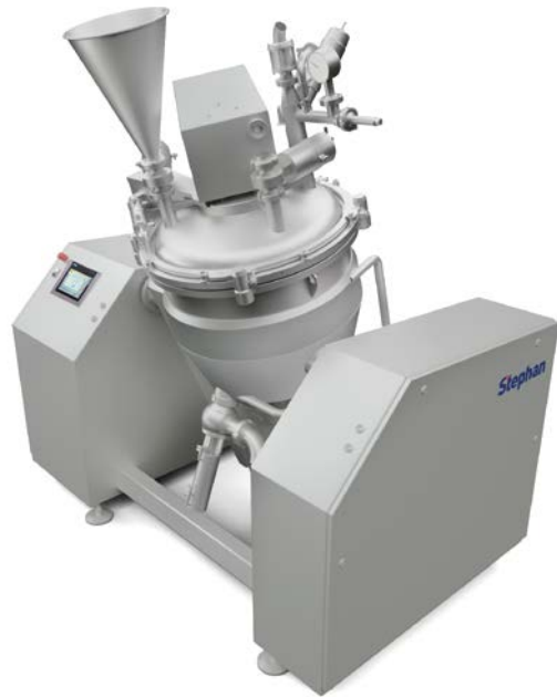
STEPHAN Universal Machine UM 200