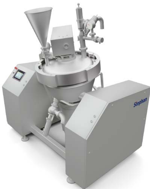
STEPHAN Universal Machine UM 130 overpressure execution