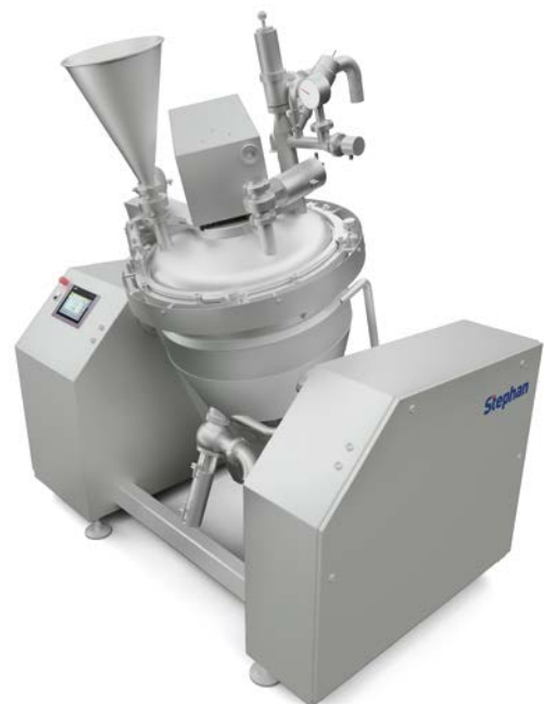
STEPHAN Universal Machine UM 200 overpressure execution